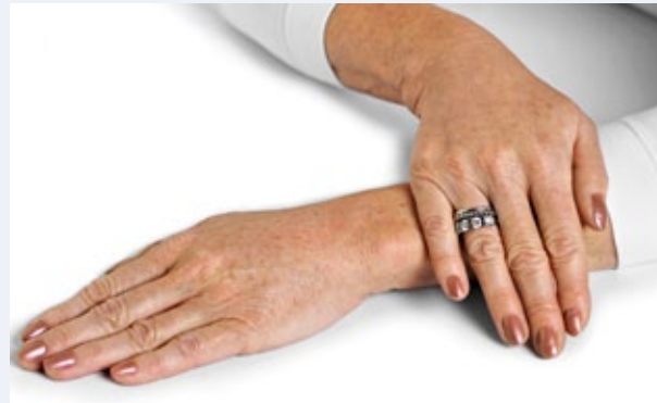
Before and after pictures following a course of 3 Restylane Vital Light treatments